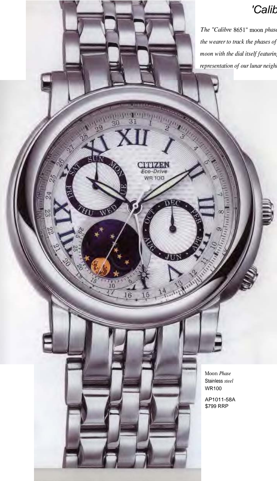
Moon Phase Stainless steel WR100 AP1011-58A $799 RRP

The "Calibre 8651" moon phase allows the wearer to track the phases of the moon with the dial itself featuring a visual representation of our lunar neighbour.