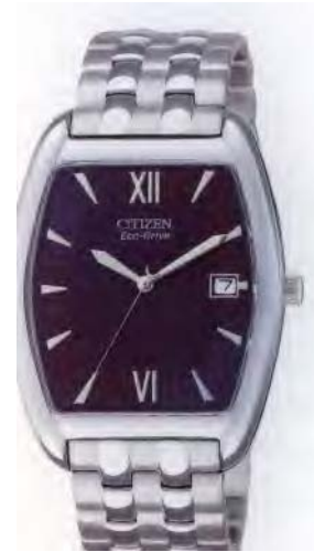
Stainless steel BM6420-53L $299 RRP

Gents "Unstoppable" Eco-Drive, from as little as $299 is affordable with modern designs.