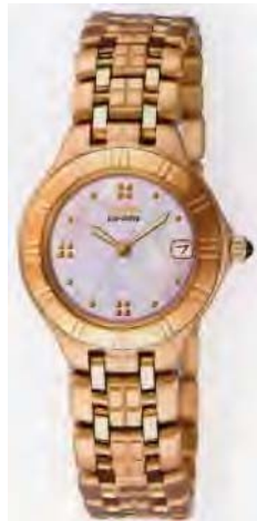
Mother of pearl dial Cabochon crown Stainless steel EW0712-56D $375 RRP