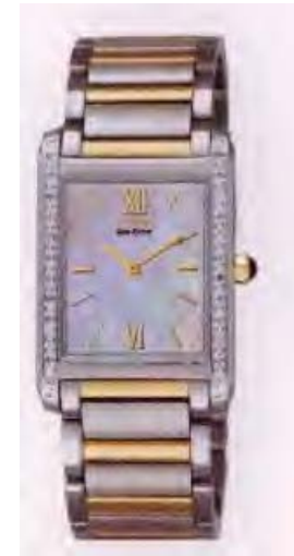
24 Diamonds Mother of pearl dial Cabochon crown Stainless steel EP5734-500 $650 RRP