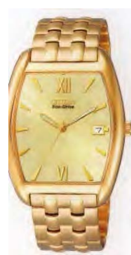
Stainless steel BM6422-58P $350 RRP