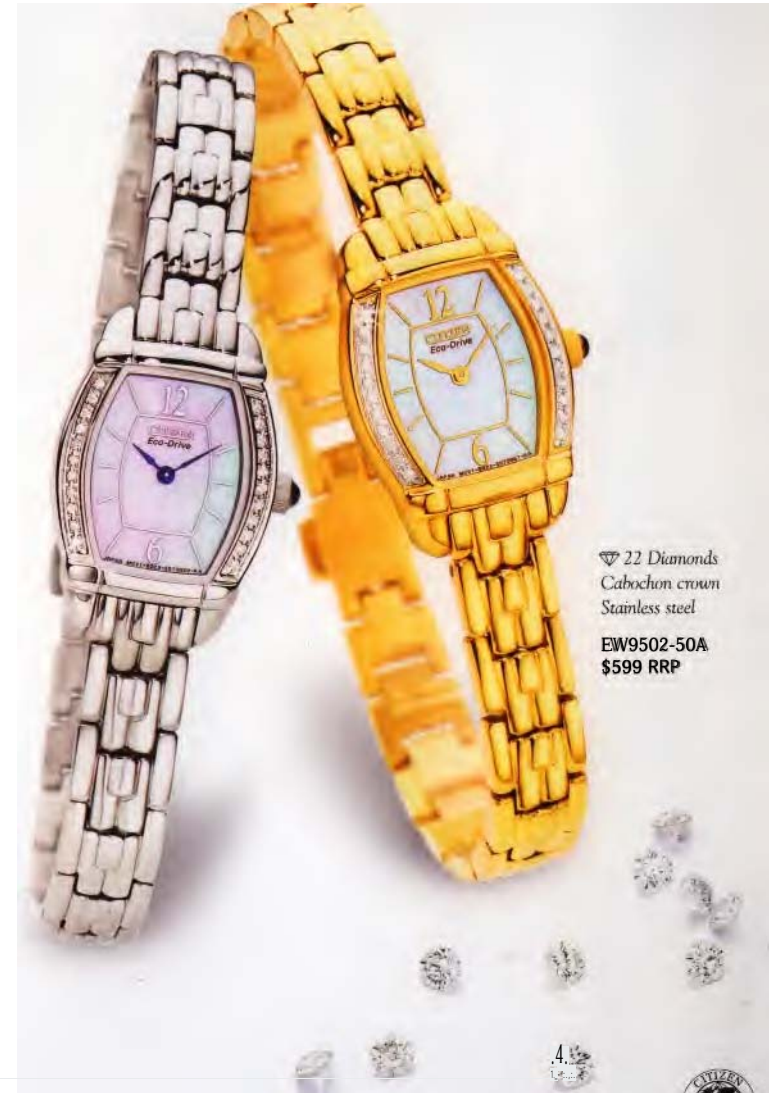
22 Diamonds Cabochon crown Stainless steel EW9502-50A $599 RRP

A mesmerising and gorgeous timepiece designed to mystify the sophisticated.