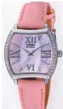
Savarovski Crystal - Stainless steel EW1150-08C $275 RRP