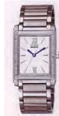
29 Diamonds Cabochon crown Stainless steel EP5730-51A $599 RRP