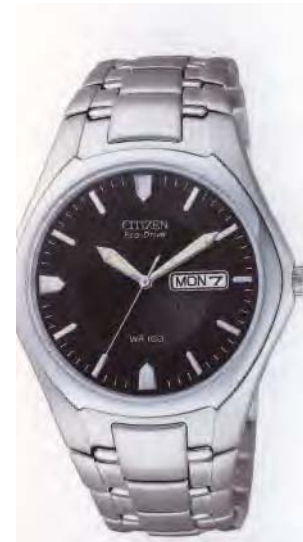
Stainless steel WR100 BM8390-51 E $350 RRP