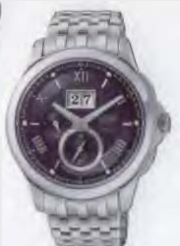
Twin Date Perpetual Calendar Stainless steel WR100