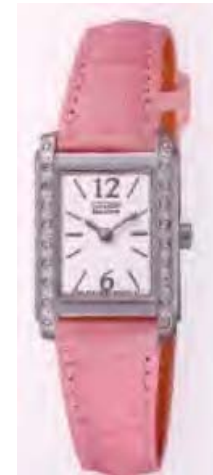
20 Diamonds Stainless steel EW9460.07A $499 RRP