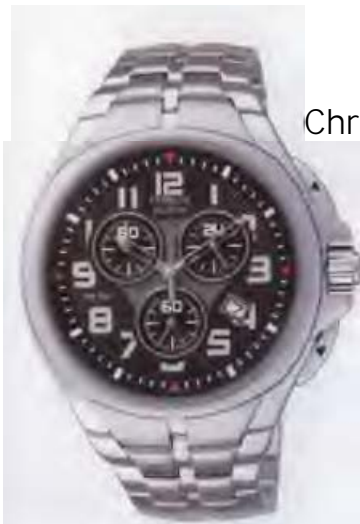
Stainless steel WR100