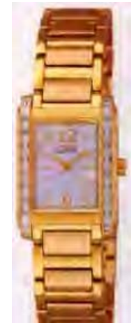
20 Diamonds Stainless steel Mother of pearl dial Stainless steel EW9462-52D $650 RRP