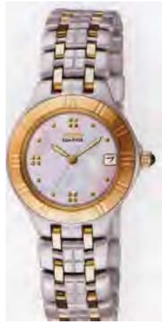
Mother of pearl dial Cabochon crown Stainless steel EW0714-51 D $375 RRP