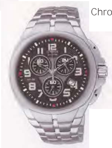
Stainless steel WR100 AT0440-61 $499 RRP