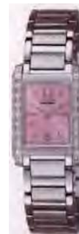
20 Diamonds Stainless steel EW9460-58X $599 RRP