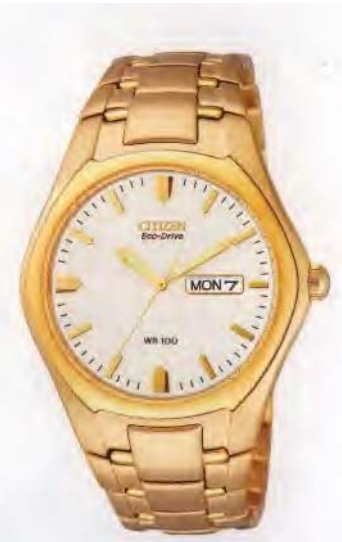
Stainless steel WR 100 BM8392-56P $399 RRP