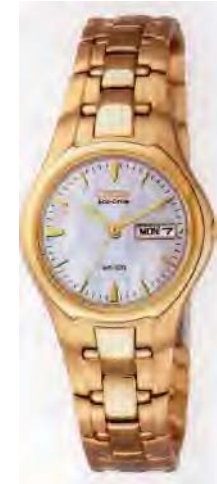
Mother of pearl dial Stainless steel WR 100