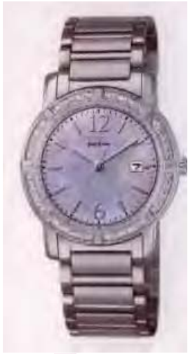
32 Diamonds Mother of pearl dial Stainless steel EW0900-56D $650 RRP

Palidoro Diamond', a collection of elegant and modern timepieces exceptionally detailed with 24 or 32 breathtaking diamonds.