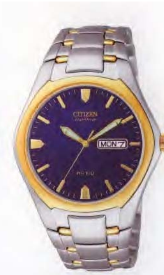
Stainless steel WR 100 BM8394-51 L $399 RRP