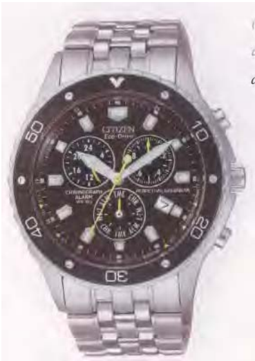
Chronograph Stainless steel WR 100 BL5290-59E $599 RRP

The stylish "Calibre 8700" boasts advanced technology with 36 genuine diamonds.