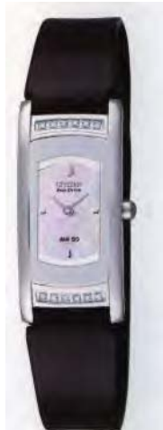
V 12 Diamonds Mother of pearl dial Stainless steel WR50 EG2470-05Y $399 RRP