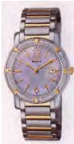
32 Diamonds Mother of pearl dial Stainless steel W0904-55D $699 RRP