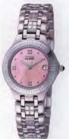
Cabochon crown Stainless steel EW0710-51Y $325 RRP