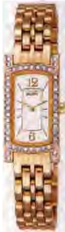
Swarovski Crystal Stainless steel