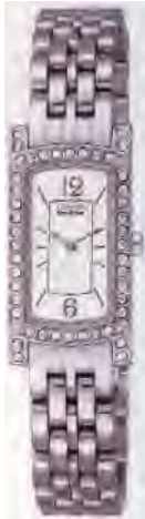
Swarovski Crystal Stainless steel