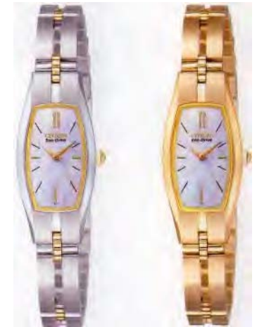
Mother of pearl dial Stainless steel