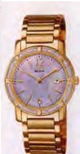
2 (Aim) Mother of pearl dial Stainless steel EW0902-51 D $699 RRP