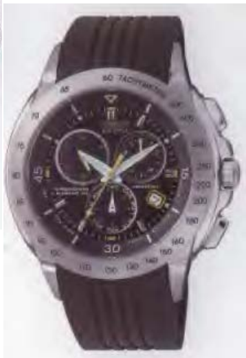
Chronograph Tachymeter Stainless steel WR100