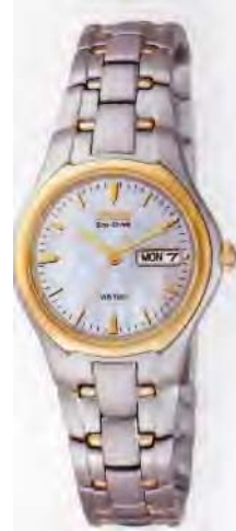
Mother of pearl dial Stainless steel WR 100