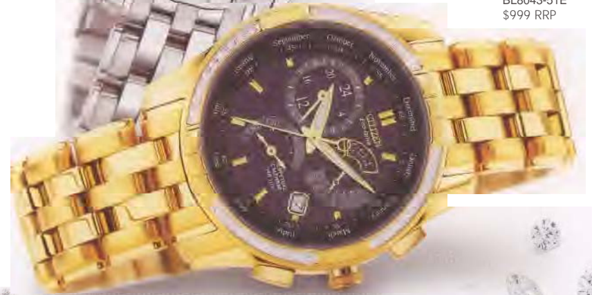
BL8043-51E $999 RRP