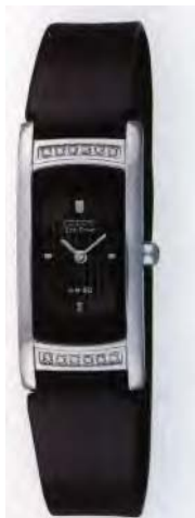
V 12 Diamonds Stainless steel WR50 EG2470-05E $375 RRP