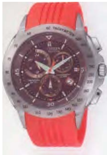
Chronograph Tachymeter Stainless steel WR100

An impressive and intelligent masculine timepiece that represents the cutting edge of technology. With chronograph features and a tachymeter, it is designed to measure the speed at which the wearer has travelled over a measured distance.