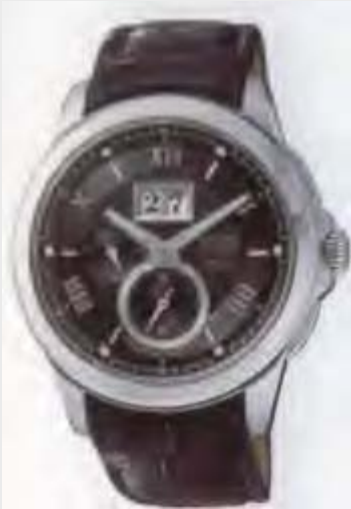
Twin Date Perpetual Calendar Stainless steel WR100